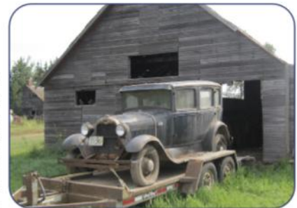
The Model A was loaded onto a trailer for moving just ten years before the barn collapsed.