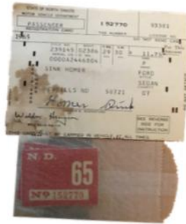
The Model A 1965 License