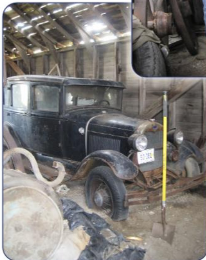
The Model A had quit running and dirt piled up around the wheels.