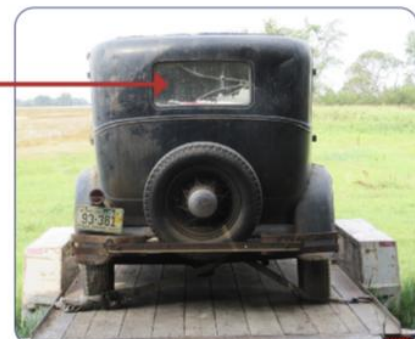
A couple of screws and a rubber washer in the window

As Homer was aging and the car was used for almost everything, Grandpa would not admit to backing it into the yard of his little house in Bowbells; cracking the back window and denting the car on the clothesline post. With a couple of screws and a rubber washer in the window, it was not to be mentioned again. These repairs still work and have been no worse for wear after all these years.